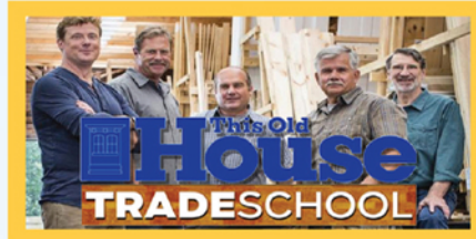
This Old House: Trade School Litton Entertainment