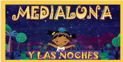
Medialuna & the Magic Nights Educ.ar