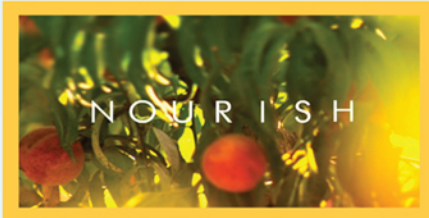
Nourish Short Films World Link

Featuring high-quality content, including: