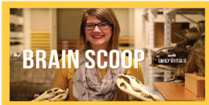
Brain Scoop The Field Museum