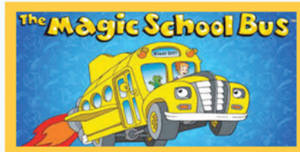
The Magic School Bus Weston Woods

Browse educational subjects that include the STEM fields, arts, and literature. Search for videos about blindness, deafness, and sign language. Also, find popular films like Blindspot , The Miracle Worker , and No Ordinary Hero: The Superdeafy Movie .