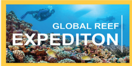
Global Reef Expedition Films Media Group