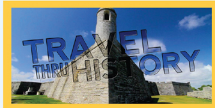
Travel Thru History Red 5 Creative