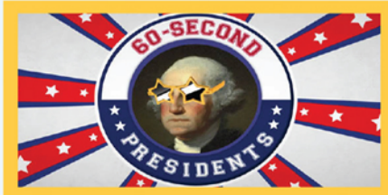
60-Second Presidents PBS Learning Media