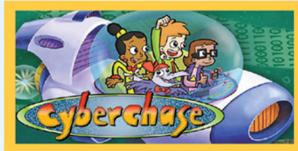
Cyberchase Thirteen Productions LLC