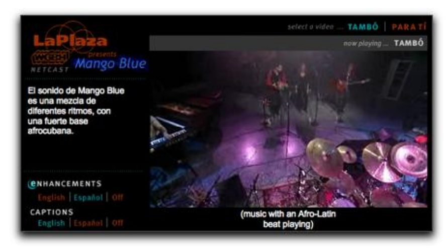
Figure 3: Example of annotations with captions.

captioning, in both English and Spanish, annotations, called "enhancements" here, are offered in different sections of the video stream.