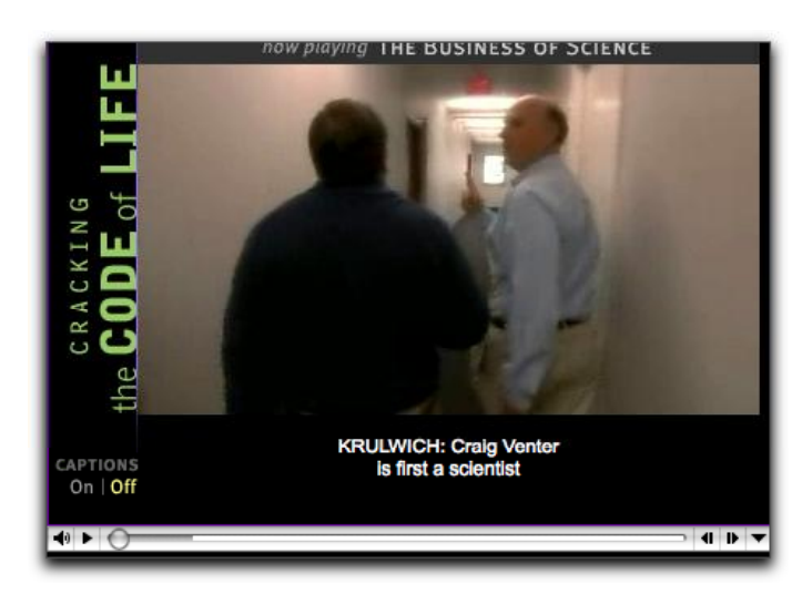
Figure 2: Sample of captioned PBS video.

For streamed video that isn't directed towards a disability group, the one mainstream exception regarding Web-based captioning is PBS. A number of its shows are provided on the Web with options for closed captioning. The following example from PBS (www.pbs.org) is just one of many available streaming videos that provide captioning.