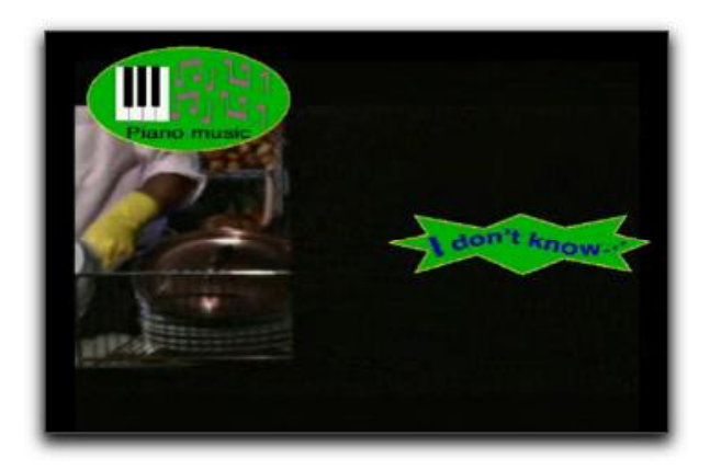
Figure 8: Example of graphics to convey language and sounds.

Graphics can be employed to convey feeling or even movement. Marblemedia's "Il Menu," a comical opera, was enhanced with comic art speech bubbles and icons. Using speech bubbles, words can have shapes around them, and be shaped themselves, to match the tones and affect that are produced by the speaker.