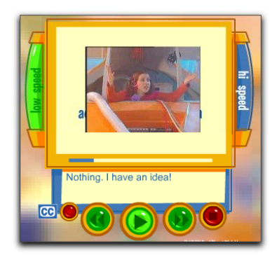
Figure 1: Example of captioned streamed video.

MarbleMedia is one of the few new media companies to provide captioning of streaming video (www.deafplanet.com). The following example is from MarbleMedia's web site where they are currently providing short captioned clips from their TVO production, DeafPlanet. Deaf children make up a fair portion of the audience for a show that is geared to Deaf and Hearing children and their families.