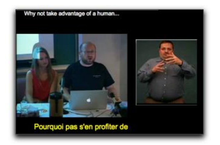
Figure 7: Example of multilingual captions.

A second video window option may provide sign language interpretation, or even mime or creative dance as a way to convey music and or sound effects. In the following example, both French and English captions are provided. This kind of flexibility provides much opportunity for letting users set different language preferences and yet enjoy the same experience.