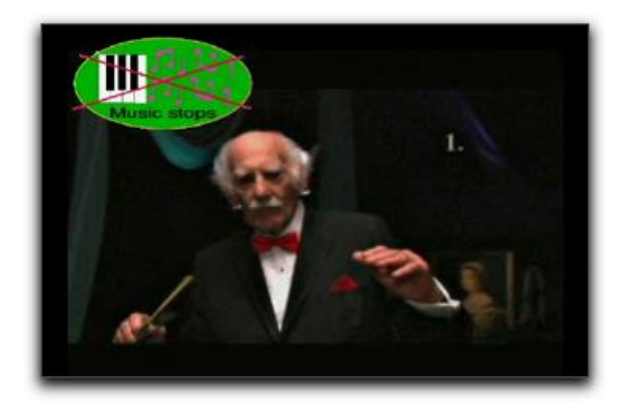
Figure 9: Example of graphics to convey silences and pauses.

Graphics can be used to create dramatic effects that come closer in reproducing the impact of the original audio than plain text. The piano keys icon is marked by a red "x", indicating that the music has stopped. For the listener, the pausing of the music is quite unexpected; the "x" effect produces a similar sudden surprise visually for the caption user. Conventional captioning with text would have employed the words "Silence" or "Music stopped" which may not achieve the same effect that of the crossed out icon.