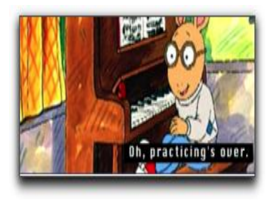
Figure 4: Example of traditional appearance, mixed case captioning.

Traditional broadcast captioning provides a single mono-spaced font, size, style, and colour, usually white, appearing over a black background. We are restricted to the area of the broadcast screen itself, so all captions must be placed on the actual video. The broadcast is always time-based, with captions appearing and disappearing for the next set of captions. There's usually enough time to provide verbatim captioning, but often additional information such as speaker pitch and intonation, music, and background sounds, is not adequately conveyed if at all. The most notable change occurring with this format the past forty years has been the shift to mixed case captioning several years ago.