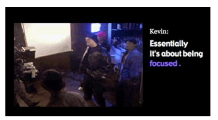
Figure 5: Example of captions with enhanced font styles.

There are no limits to how caption text can be presented on the web. All three media players support a full suite of text styles. Layout of captions is not limited to being placed over the actual video, but may be positioned off video when appropriate. Due to the small frame size of videos that are streamed on the web, it may make more sense to place text outside of the video, itself. In addition, text presented in different fonts, colours, and style can be used to identify speaker, content, emphasis, and even emotions. In the clip below, different fonts and colours are employed and positioned to the right of the video.