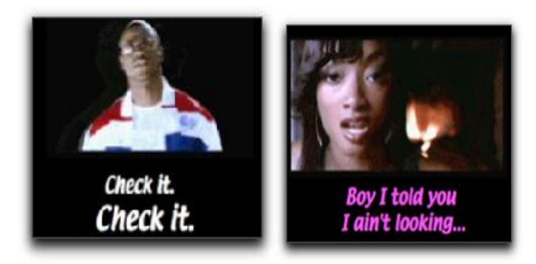
Figure 6: Example of enhanced caption font style used to convey tone and energy.

Authors of original video content may choose to enhance the emotive tone of their subjects. In the following clips from the music video "Boy Like You" director Erica Shallow added enhanced captions to highlight the vocal styles of the different performers. Erica felt that having style control over her captions allowed her to capture the emotions and the energy that would otherwise go missing, and that standard captions would "flatten" the experience for the Deaf viewer.